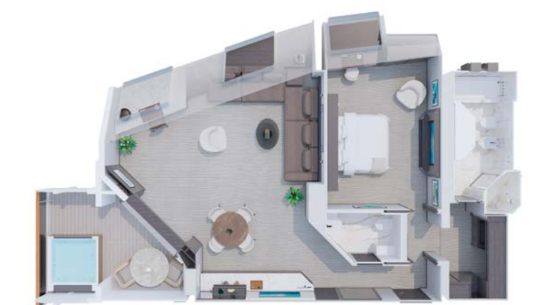
RETREAT RESIDENCE RR

DECK: 7, 8, 9 - Forward NUMBER OF SUITES: 6 MAXIMUM CAPACITY: 3 adults or 2 adults and 2 children under 18 years old