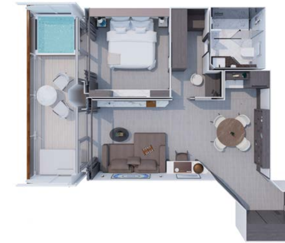
COVE RESIDENCE CO

DECK: 6, 7, 8, 9, 10 - Middle NUMBER OF SUITES: 10 MAXIMUM CAPACITY: 3 adults or 2 adults and 2 children under 18 years old